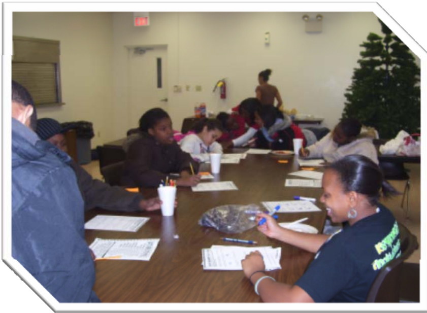
Marcum Terrace (Teen Center) Monday's @ 4:30pm