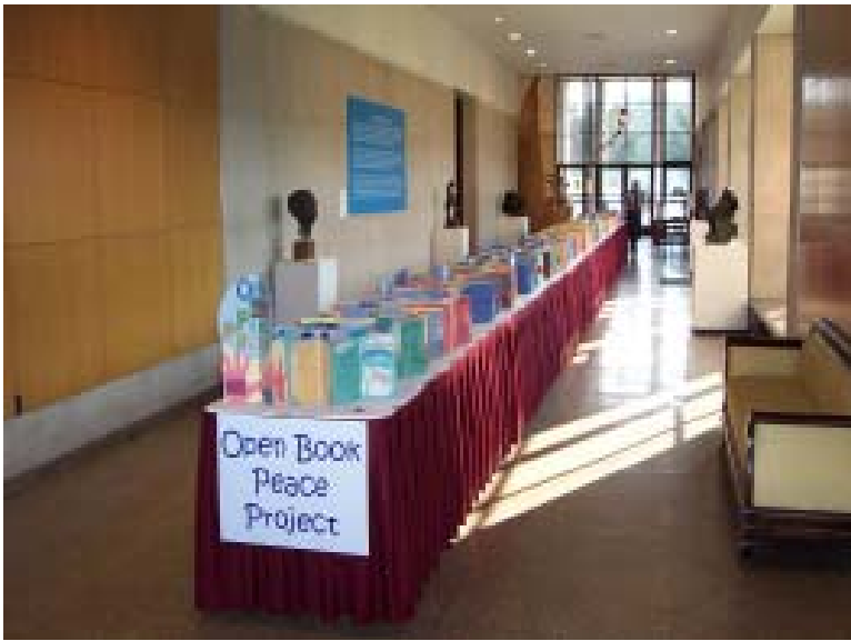
During the Hilltop Festival the museum placed the entire book on display for all to see.

When it is opened, the book measures over two football fields long and is still growing. The goal of the Peace Book Project creator is to have the book visit every continent of the world and have other children and youth add their page for peace.